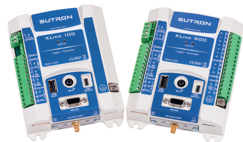
XLink 100 and XLink 500