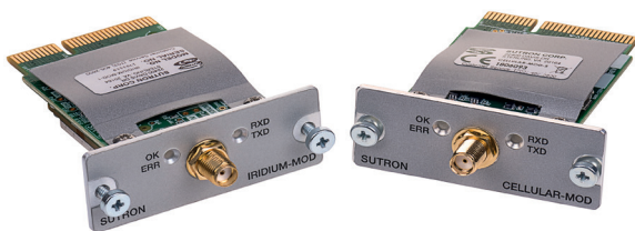
CELLULAR-MOD-5 and IRIDIUM-MOD card