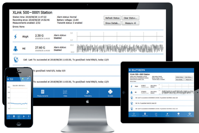
LinkComm software and mobile app